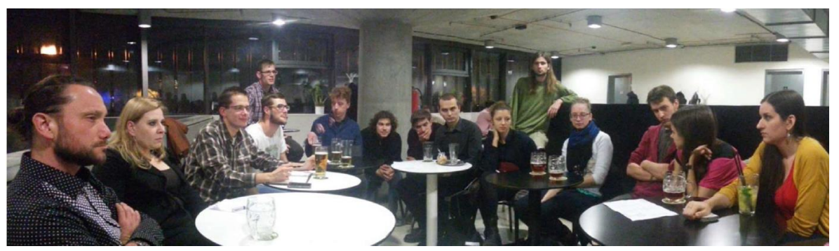
Fig. 1: The meeting for students of Faculty of Environmental technology held in 2016

Organization of this type of meetings will be supported in the future. We will also discuss the possibility of foundation of a student's association for easier communication and reporting proposals to faculty representatives.